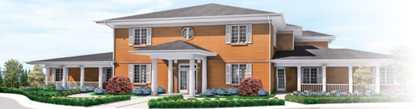
Notional rendering of a 16-suite Fisher House

The new Pittsburgh regional Fisher House will make logistics more convenient for guests who now will be lodged near their loved ones. The convenience of a second Fisher House will be so appreciated by the guests, who previously may have had to travel from Oakland to O'Hara Township.